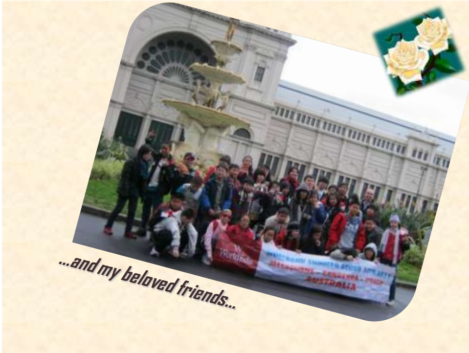
...and my beloved friends...

Now, we are exploring somewhere in Melbourne... 😊